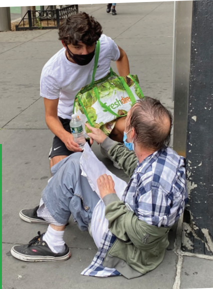
LAMP Missionary shares a bottle of water and an encouraging word.