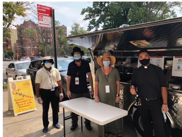
LAMPcafe outreach with three LAMP Missionaries on the left and a Jesuit Seminarian on the right, assisting.