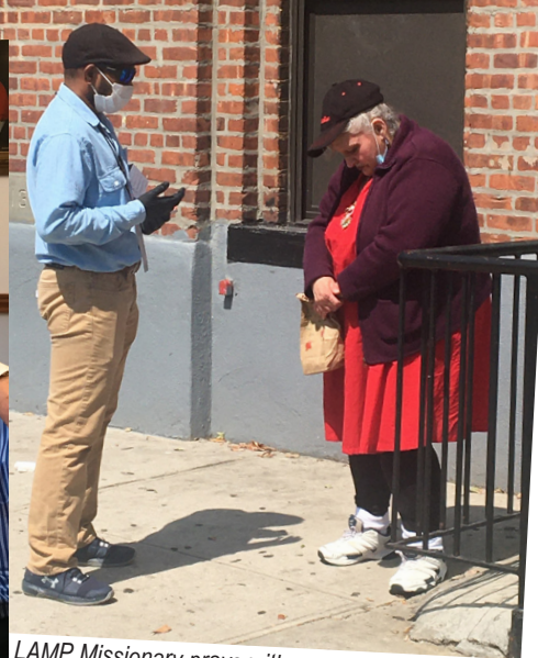
LAMP Missionary prays with a woman who lives in a shelter, with sandwich in hand from the LAMPcafe.