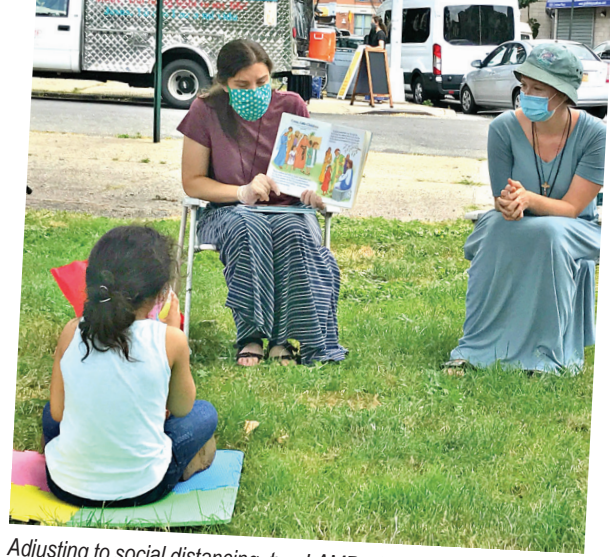
Adjusting to social distancing, two LAMP Missionaries read Gospel stories to children, with LAMPcafe in background.

to occasionally make sandwiches with our children and together take them to the Bowery section of lower Manhattan, which was well known for its poverty and alcoholism. We would visit with the men on the street, who were so happy to be noticed. Sometimes we helped the Missionaries of Charity feed the hungry at their place in the Bronx. This provided an occasion where we had a wonderful visit with Mother Theresa.